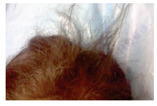
Figure 1 Patchy alopecia due to trichotillomania

Trichobezoar is the most common form of bezoars reported, with hairballs extending to the small intestine causing Rapunzel syndrome in a few cases. Trichophagia is equated to pica syndrome. Abdominal pain, anemia, and weight loss are the most common complaints. Evaluation involves ultrasonography, computed tomography and endoscopy. Endoscopic removal has been tried in few cases, however surgical elimination remains the preferred choice [2]. Treatment of trichotillomania is behavioral therapy. The importance and severity of trichotillomania should not be underrated and alertness of these disorders should be encouraged at primary health care level [3].