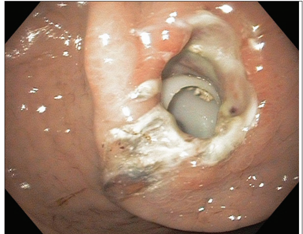
Figure 1 Percutaneous endoscopic gastrostomy bumper buried within gastric wall

Buried bumper syndrome occurs in approximately 0.3-2.4% of the patients [1]. Lee and colleagues reported an incidence of 8.8% occurring on average 18 months after PEG placement [2]. It is a complication of PEG placement due to inordinate pressure and traction of the internal PEG bumper on the gastric wall and, albeit rare, is associated with significant morbidity. Patients with buried bumper may manifest with difficulty to infuse feedings through the PEG, abdominal wall abscess, peritonitis or necrotizing fasciitis among others [3].