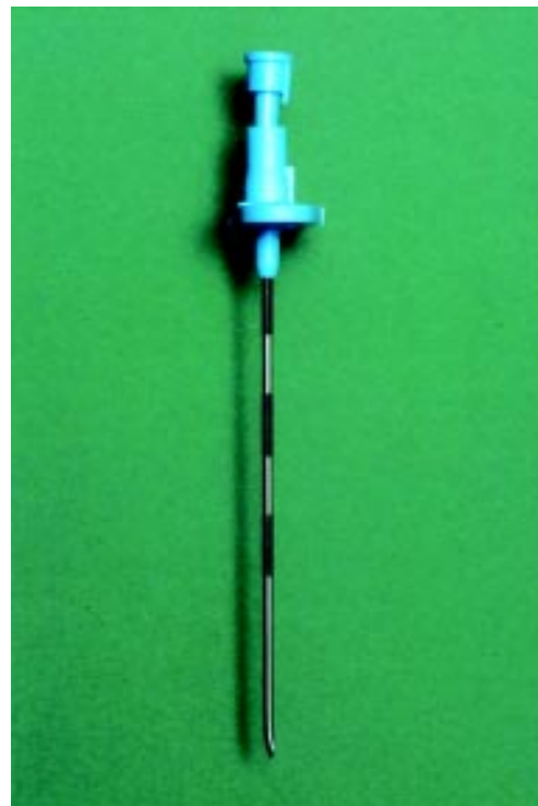
Figure 1. A Tuohy needle is used to stabilize the small and flexible button for insertion through a tight gastric tract.

The tract of the abdominal and gastric wall is dilated by passage of graduated dilators (X-ray dilators, PBN Medical, Denmark A/S) along the guide wire. The size of maximal dilatation is 2 Fr higher than the diameter of the button (eg. up to 14 Fr size for a 12 Fr button). The thickness of the abdominal wall is estimated for the choice of the appropriate length of gastrostomy button (AMT mini button, Applied Medical Technology, Cleveland, USA). A Tuohy needle with a 16G lumen (SIMS Portex Ltd, UK) is passed into the button to enable it to go over the guide wire and slide into the stomach (Fig 1). Traction is applied via the U-stitches to the anterior gastric wall to facilitate this step (Fig 2). The needle and the guide wire are removed. The balloon is inflated and the anchor stitches are tightened and tied over the wings of the button. The initial volume of inflation (3ml) is less than the recommended to allow for oedema of abdominal wall to develop during the first few postoperative days. The proper approximation of the stomach on the anterior abdominal wall is verified prior to removal of the laparoscope (Fig 3). The umbilical