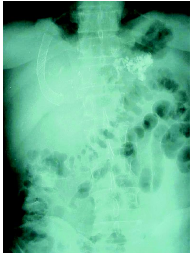
Fig. 1. Abdominal X-ray of the patient following emergency endoscopy that shows deposits of n-butyl-2-cyanoacrylate (Histoacryl) and lipiodol solution in gastric varices. The TIPS stent is also obvious at the right upper quadrant

Following resuscitation, urgent endoscopy revealed