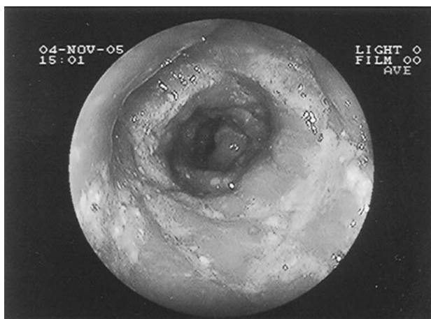
Fig. 3. Two-week endoscopic follow-up

In our case, there was no tumor related cause of bowel obstruction, which is uncommon. It also presents an alternative option in management of such conditions, as it was successfully corrected during endoscopy.