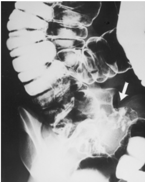
Figure 1. Oedema and cobblestoning of the caecum and ileocaecal valve.

Abdominal computed tomography showed phlegmon