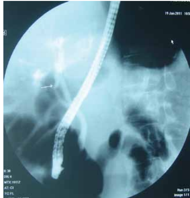
Figure 1 Endoscopic retrograde cholangiogram showing a leak from the cystic duct stump (arrow).

ERCP complications were classified and graded according to the consensus criteria of Cotton et al [8]. Early post-ERCP complications evaluated were bleeding, submucosal injection or perforation, pancreatitis, cholangitis, and basket