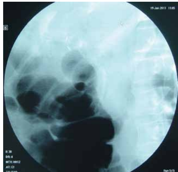
Figure 2 Radiograph showing a Tannenbaum stent (Wilson-Cook, Athens) inserted proximally to the site of the bile leak.

impaction [9,10]. The stents were removed after an interval of four to eight weeks. Patients with CBD or CHD leak and associated stenosis were followed for possible development of biliary stricture with liver function tests and US every three months in the first post-procedure year. MRCP or ERCP was performed only in the case of clinical symptoms or abnormal liver function tests or US.